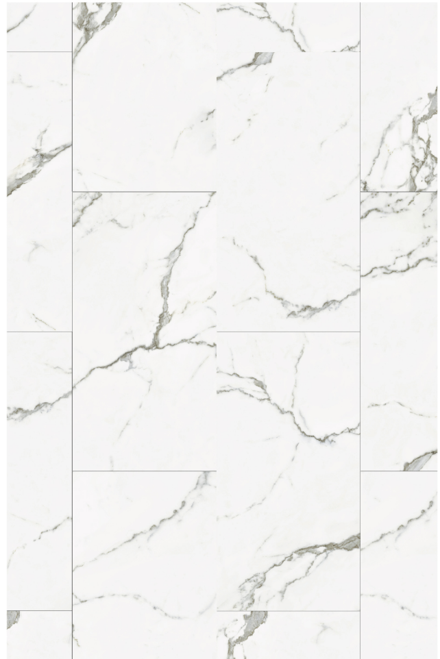
T99835 CARRARA WHITE HYBRID