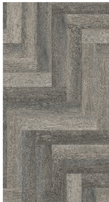
H9904 CAIRO OAK