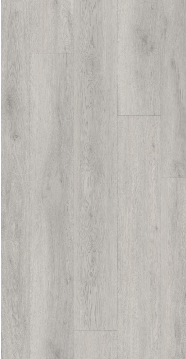
9901 LIGHT GREY