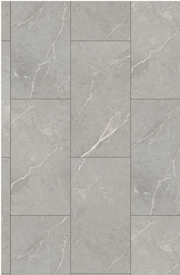
T99892 VENCY GREY HYBRID