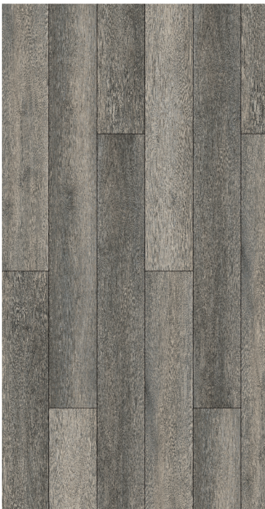
9904 CAIRO OAK