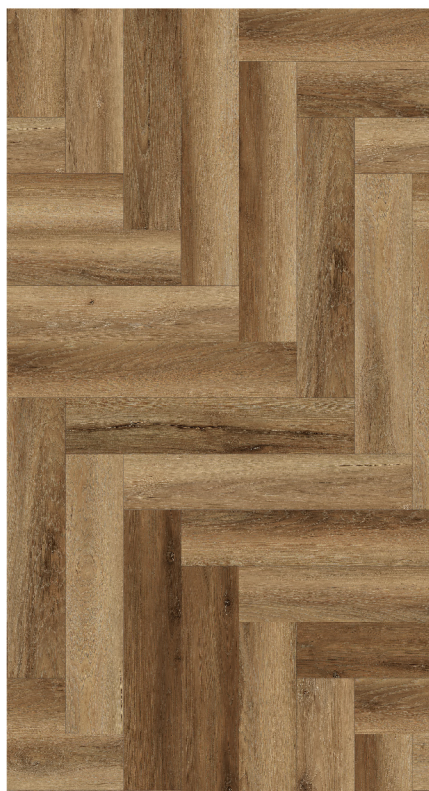
H9921 LUCILE HICKORY