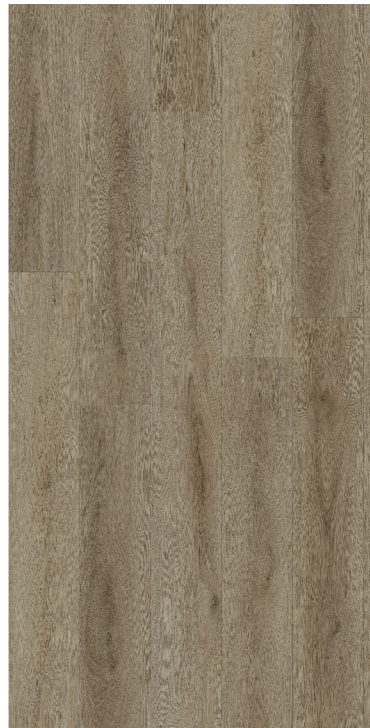
9911 CLASSIC OAK