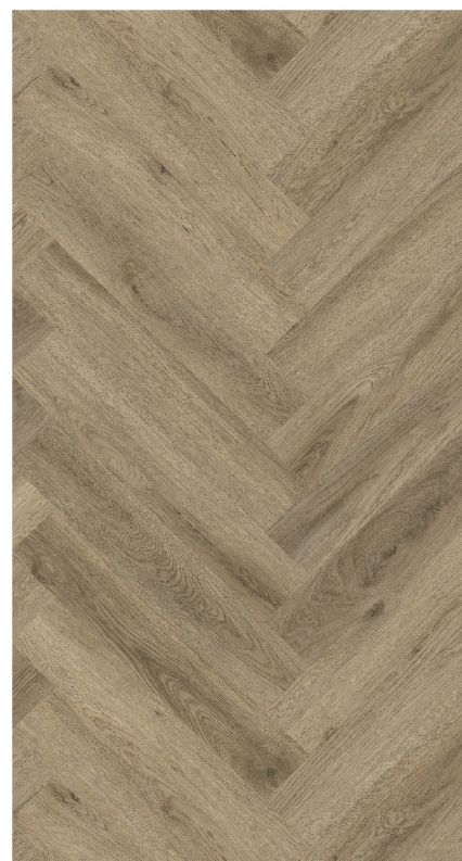
H9911 CLASSIC OAK