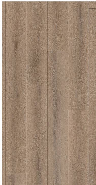
9905 WARE OAK