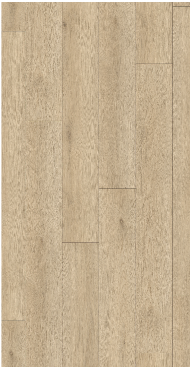
9910 McCall OAK