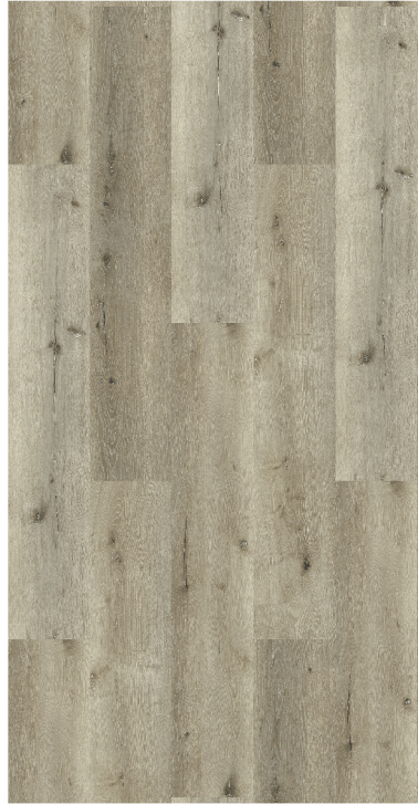
9902 GREY OAK