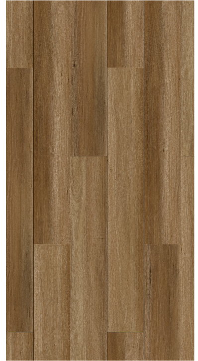
9903 SPOTTED GUM