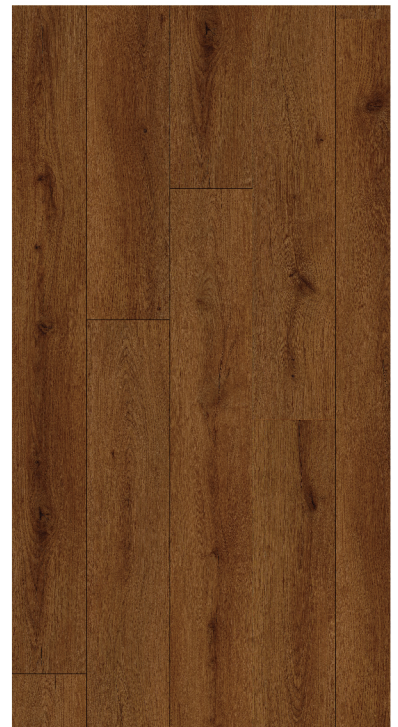
9906 THURN OAK