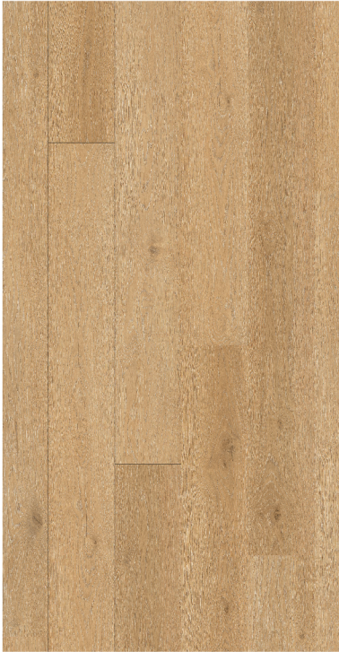
9907 YORK OAK