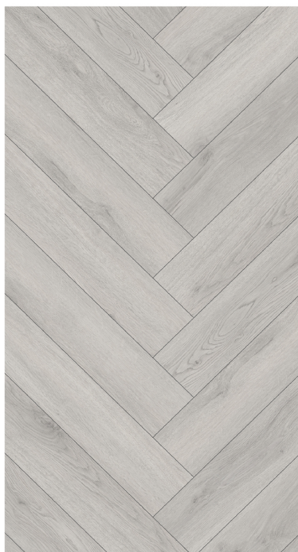
H9901 LIGHT GREY