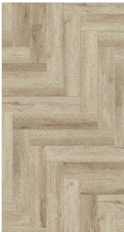
H9922 MINTO HICKORY